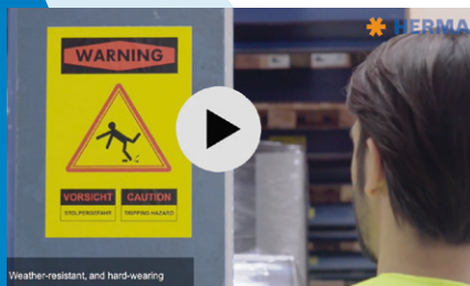
Hard-wearing signal signs

For further information, contact your partner at HERMA.